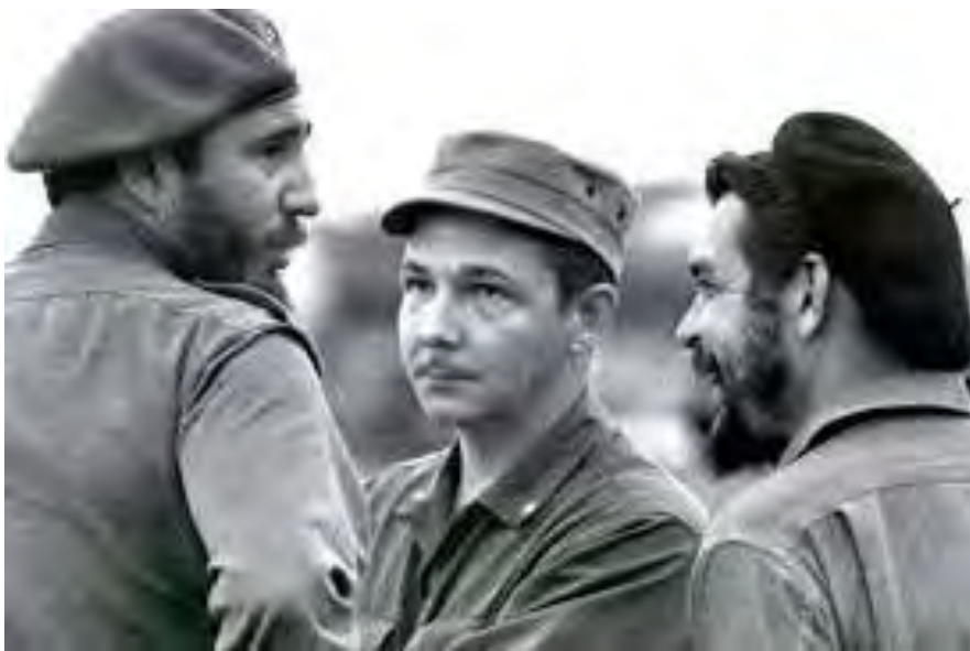
Fidel Castro, Raúl Castro, and Che Guevara, early days of the revolution

Raúl Castro Ruz will be 95 on June 3 rd —for 73 years he has committed appalling crimes against Cuba's citizens and deprived them of their fundamental civil, political, economic, social, and cultural rights, starting with that of self-determination.